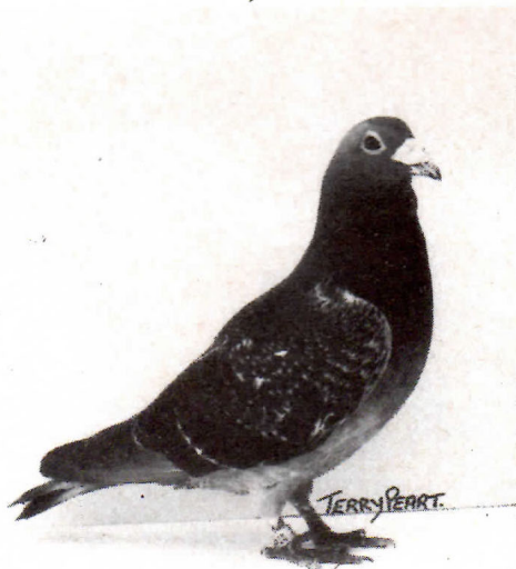
'Cliddesden Charmer', 16th Sect, 113th Open NFC Nantes; 9th Sect NFC Nantes; 5th Fed Dax