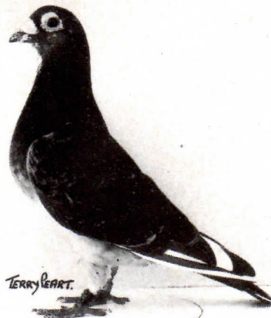
'Cliddesden Charmer' 19th Fed, 7th Fed Plymouth, 10th Fed Weymouth