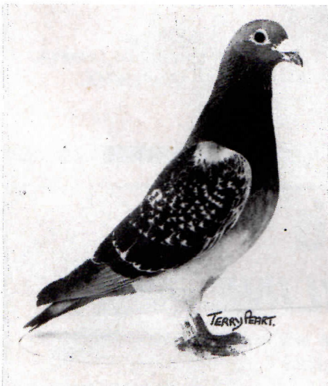
'Cliddesden Ricardo', 2nd Fed Weymouth, 15th Fed Saintes, 1st Fed Rennes