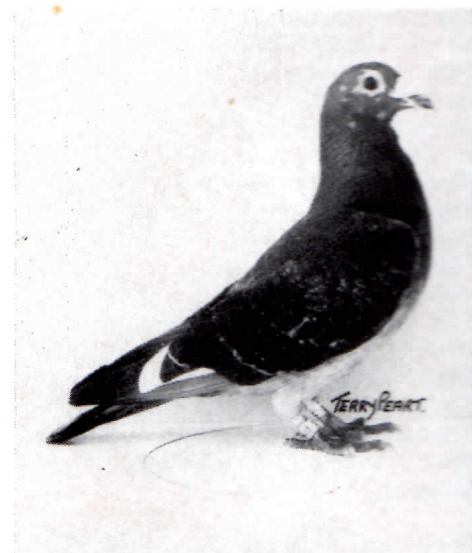
'Cliddesden Hat Trick', 15th Fed, 16th Fed Exeter, 13th Fed Nantes, 11th Fed Saintes